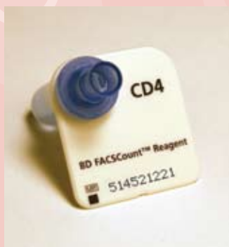
BD FACSCount CD4 Reagent (Cat. No. 339010)

This reagent delivers absolute CD4 counts and CD4 percentages.