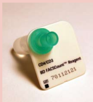
BD FACSCount CD4/CD3 Reagent Kit (Cat. No. 342512)

This reagent delivers absolute CD4 counts and CD4 percentages.