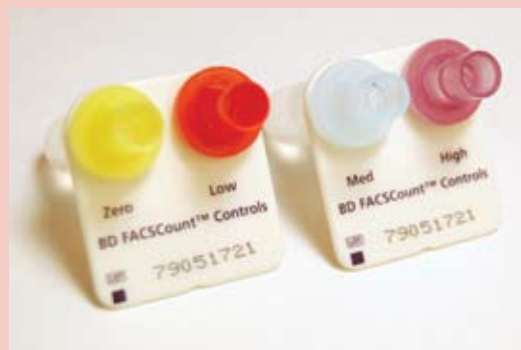
BD FACSCount Control Kit (Cat. No. 340166)