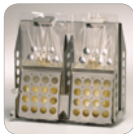
DH8 Basket With Frozen Plasma