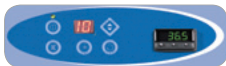
QuickThaw Control Panel for DH2