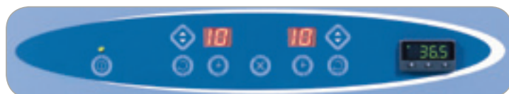
QuickThaw Control Panel for DH4 and DH8