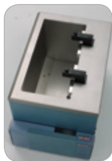
Stainless Steel Chamber